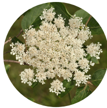
Queen Anne's Lace